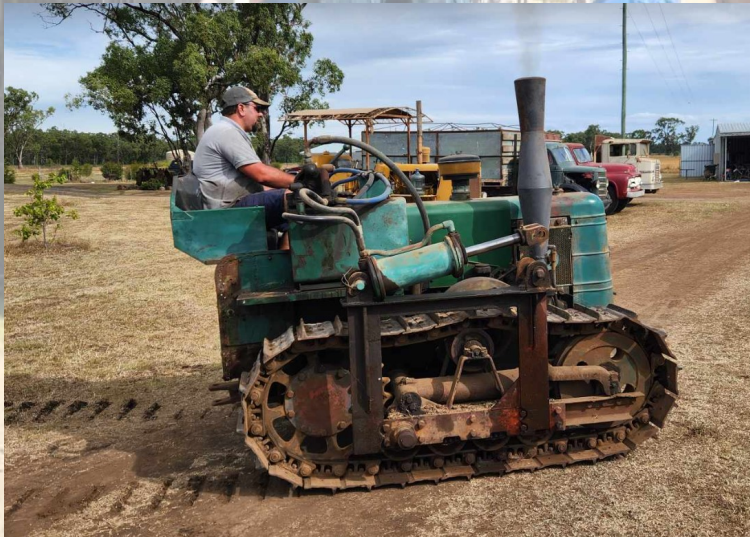
VF Fowler Crawler

A great day was had by all including morning tea and a sausage sizzle lunch.