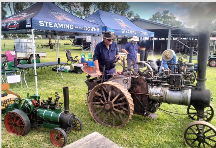
The boys from Ballina getting ready for a big (hot!) day