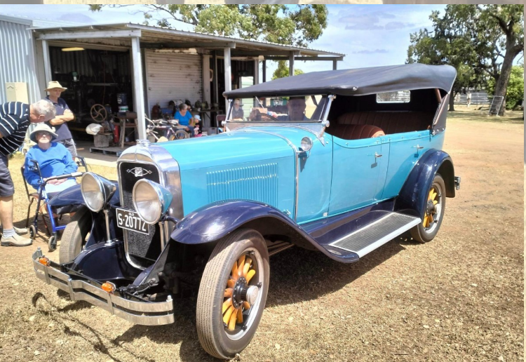
Ashley Woods' 1929 Buick