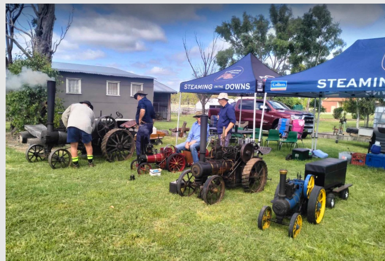
Nice selection of engines on display